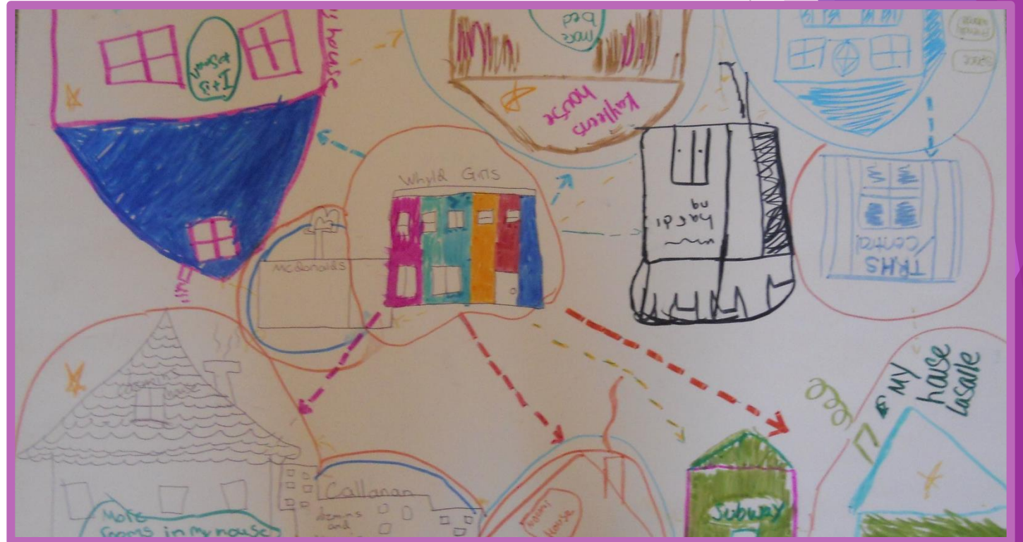
Design Dialogues in Action